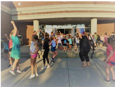
Students enjoy the first Friday Dance Party of the school year! 😊